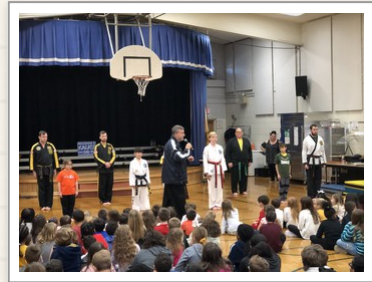
Special Thanks to Mackenzie's Karate!